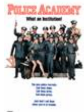
Marion Ramsey (Actress and Comedian)