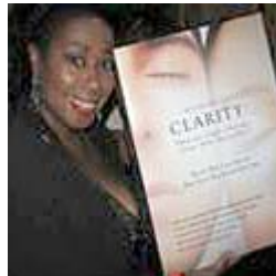
"Sergeant Hooks" on Police Academy