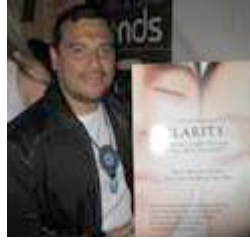
Mind of Mencia , Comedy Central