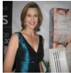
"Mary Alice Young" on Desperate Housewives