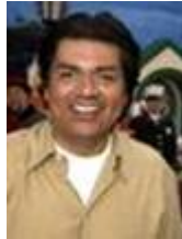
George Lopez (Actor and Comedian)