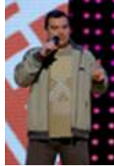
Carlos Mencia (Comedian)