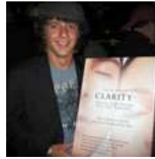
"Logan Reese" on Zoey 101