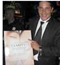
Primer Impacto for Latin TV Univision