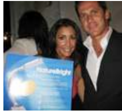
The Bold and the Beautiful for CBS Philanthropist