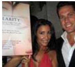
The Bold and the Beautiful for CBS Philanthropist