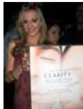
"Julie Mayer" on Desperate Housewives