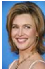
Brenda Strong (Actress)