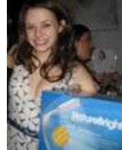
"Danielle Van De Kamp" on Desperate Housewives

For more information about NatureBright's products, visit www.naturebright.com .