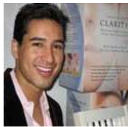
Saved by the Bell , now appearing on this season of Dancing with the Stars