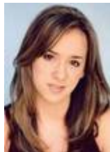
Andrea Bowen (Actress)

Share the discovery of the stars. Try one of NatureBright's natural light therapy products today!